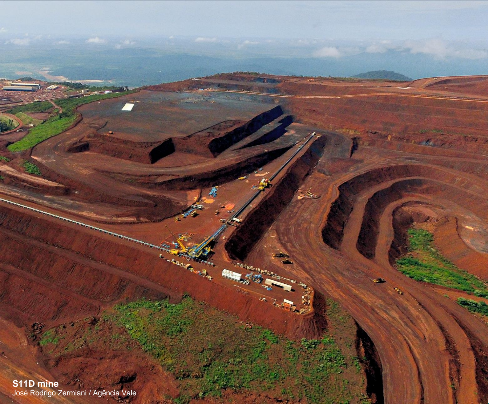
S11D mine